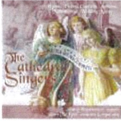
The Cathedral Singers